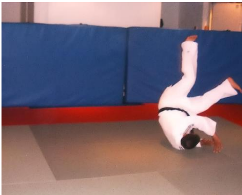
Chugaeri - Rolling