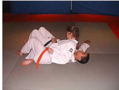
Ushiro Kesa Gatame