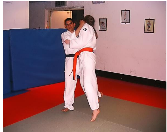
O Uchi Gari