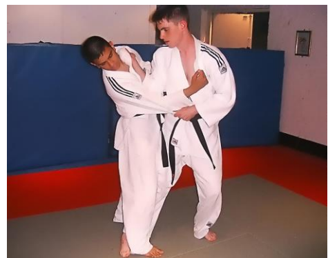
Ko Uchi Gari