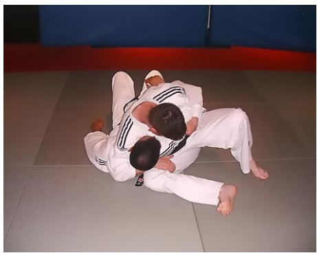
Makura Kesa Gatame