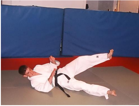
Ukemi - Side