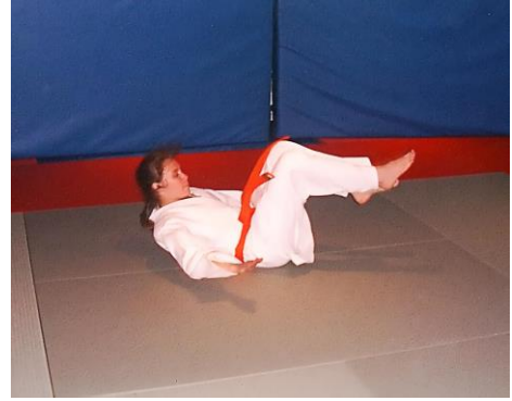
Ukemi - Back