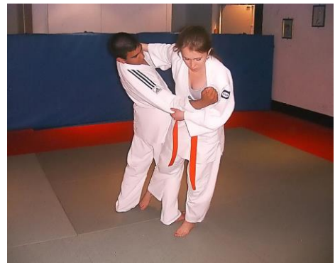
O Soto Gari