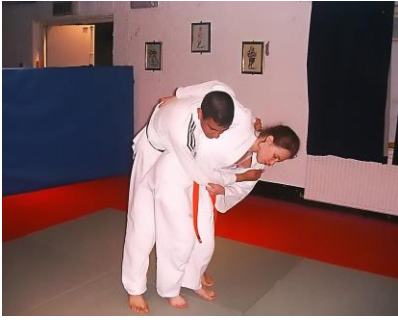
O Tsuru Goshi