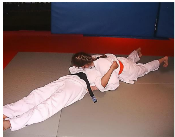
Kami Shiho Gatame