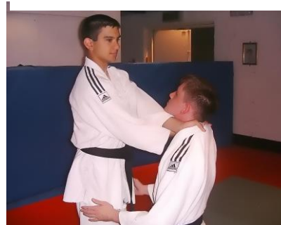
Gyaku Juji Jime