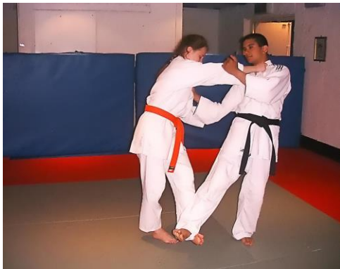
Ko Soto Gari