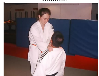
Kata Juji Jime