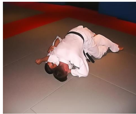
Tate Shiho Gatame