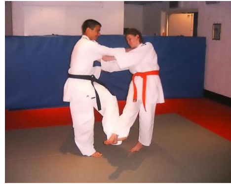
De Ashi Harai