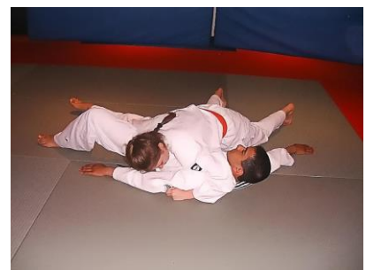
Kuzure Yoko Shiho Gatame