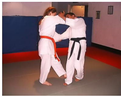
Okura Ashi Harai