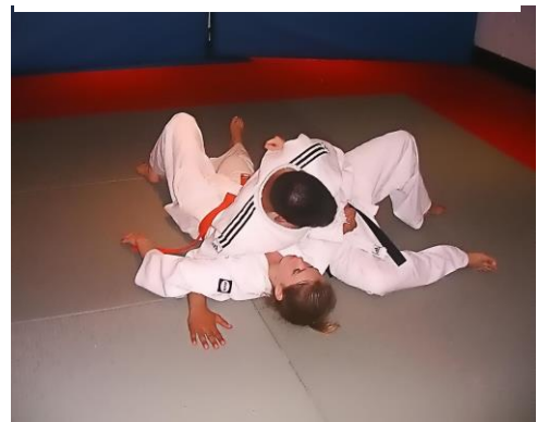
Kazuri Kesa Gatame